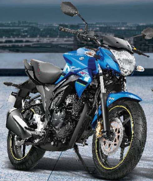
Metallic Triton Blue/ Glass Sparkle Black (KEL)