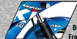
41mm Large Diameter Front Forks