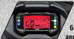
Smart Digital Instrumentation with Gear position and RPM indicator