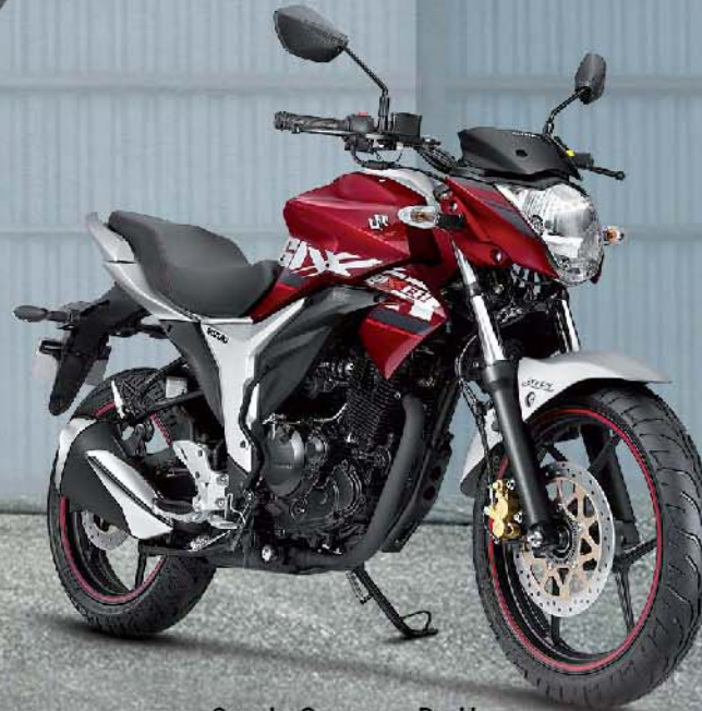
Candy Sonoma Red/ Metallic Sonic Silver (CZU)