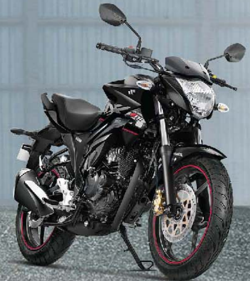
Glass Sparkle Black (YVB)