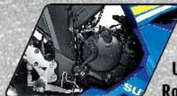
Ultra Light and Robust 155cc Engine