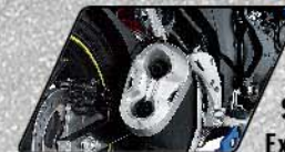
Sporty Twin Exhaust