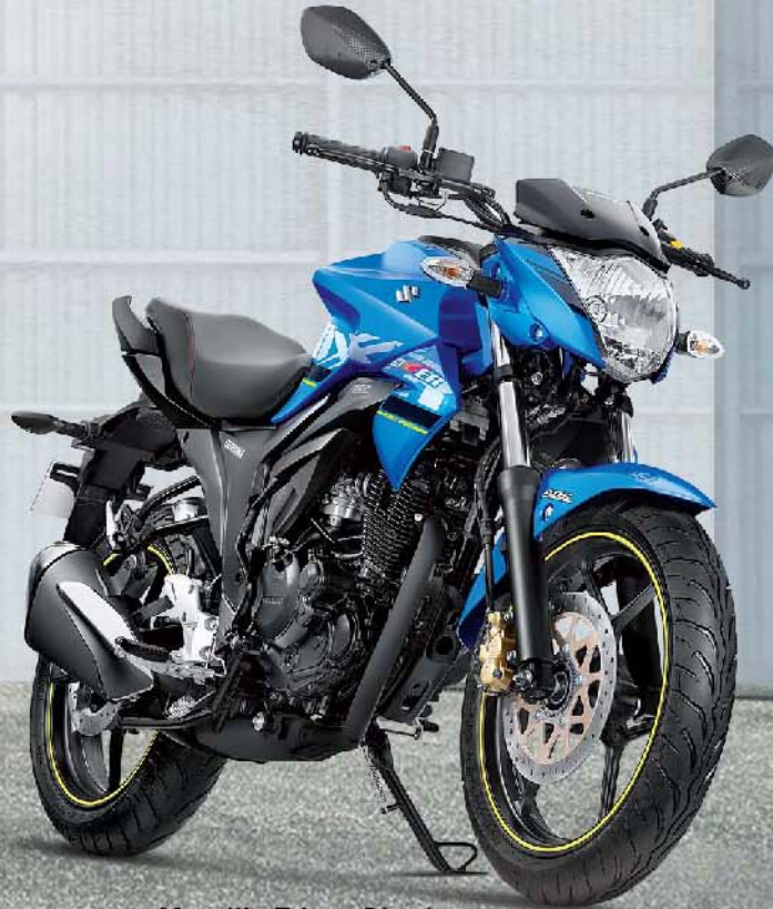
Metallic Triton Blue/ Glass Sparkle Black (KEL)