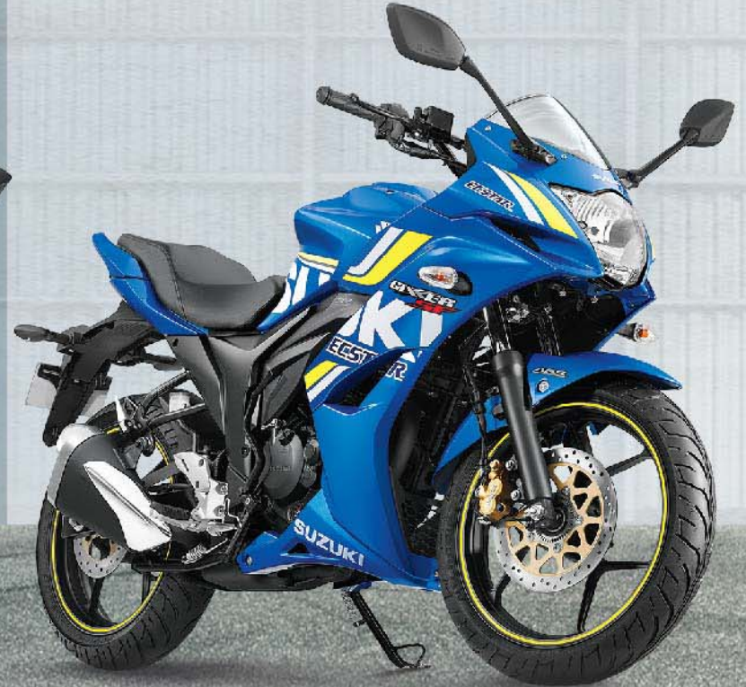
Metallic Triton Blue (YSF)