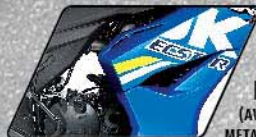
NEW ECSTAR GRAPHIC (AVAILABLE ONLY IN METALLIC TRITON BLUE VARIANT)