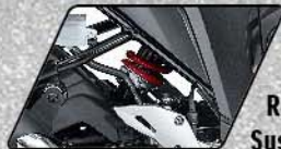
7-Step Adjustable Rear Mono Shock Suspension