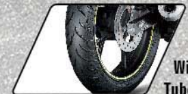
Wide Rear Radial Tubeless Tyre