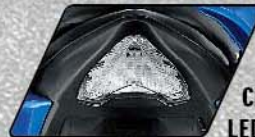
Clear Lens LED Tail Lamp