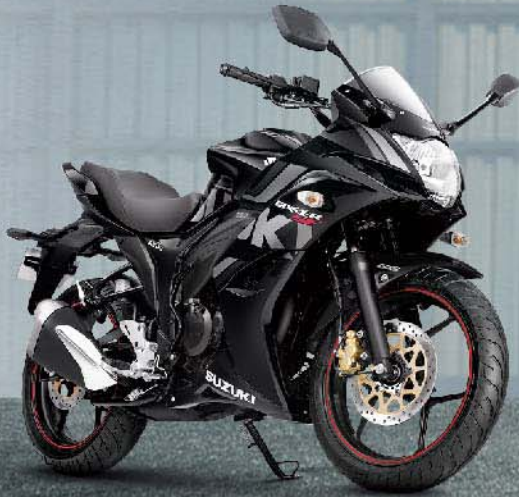
Glass Sparkle Black (YVB)