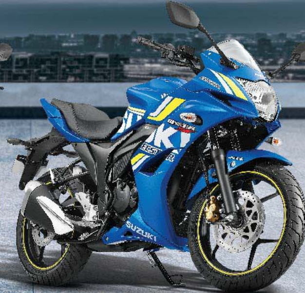
Metallic Triton Blue (YSF)