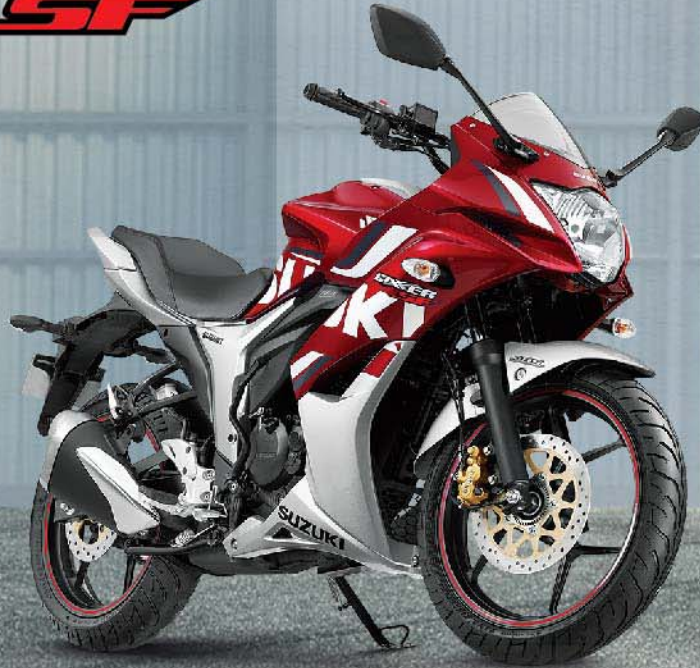
Candy Sonoma Red/ Metallic Sonic Silver (CZU)